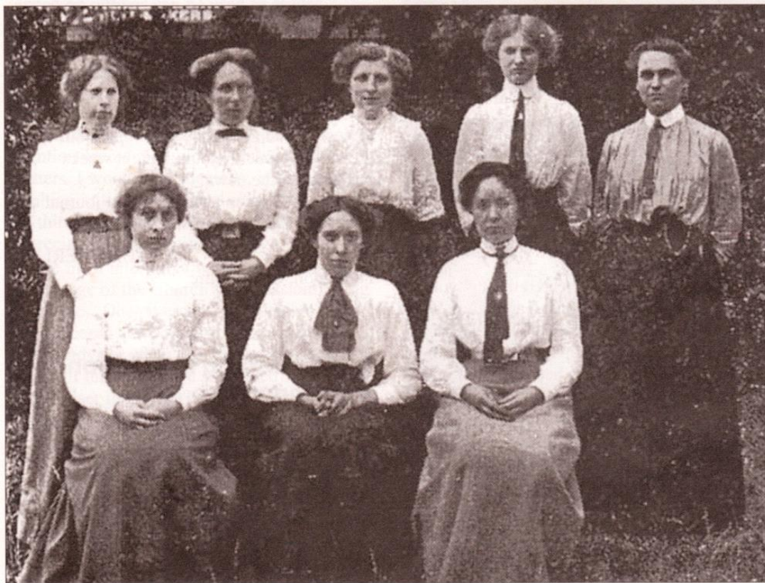
The 'All Ladies' band, 1912

I was thumbing through the pages of The Ringing World , a weekly newspaper for bellringers, and came across an article containing a photo of eight ladies, taken in July 1912 after they had just rung the first peal ever by an all ladies band in Christchurch, Cubitt Town, London. 2012 was the 100th anniversary of this epic event and it was quite an achievement, especially in those days, when church bellringing was a very male dominated activity. They all came from different parts of England and got together to achieve a first for women. This must have been the start of bellringers' "Women's Lib"! In fact, shortly afterwards they all became founder members of the Ladies Guild of Change Ringers which still exists today.