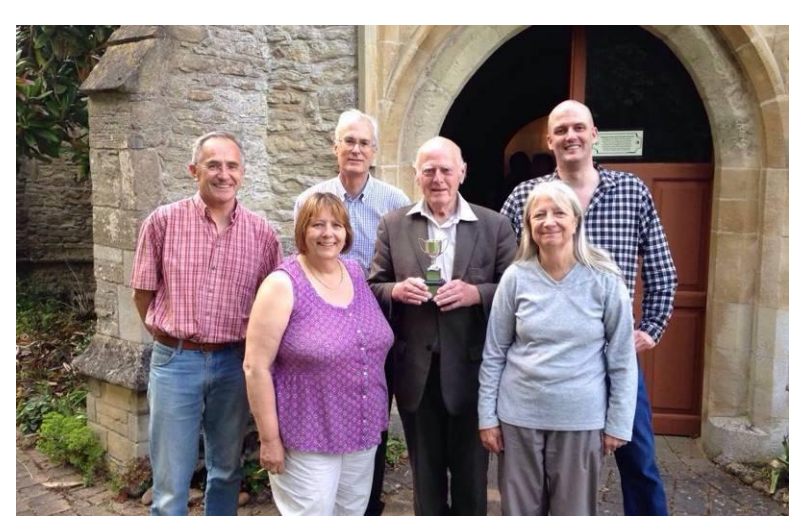
Bromham (with the method cup)