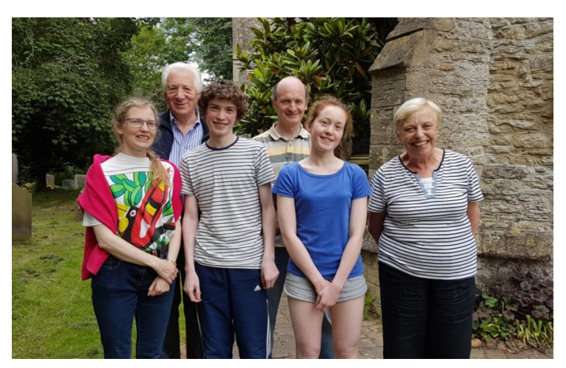
St Andrew's, Bedford