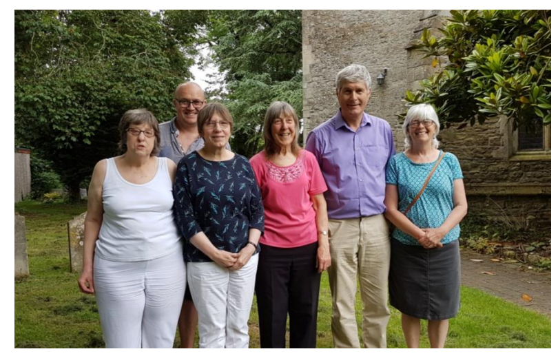
St Peter's, Bedford