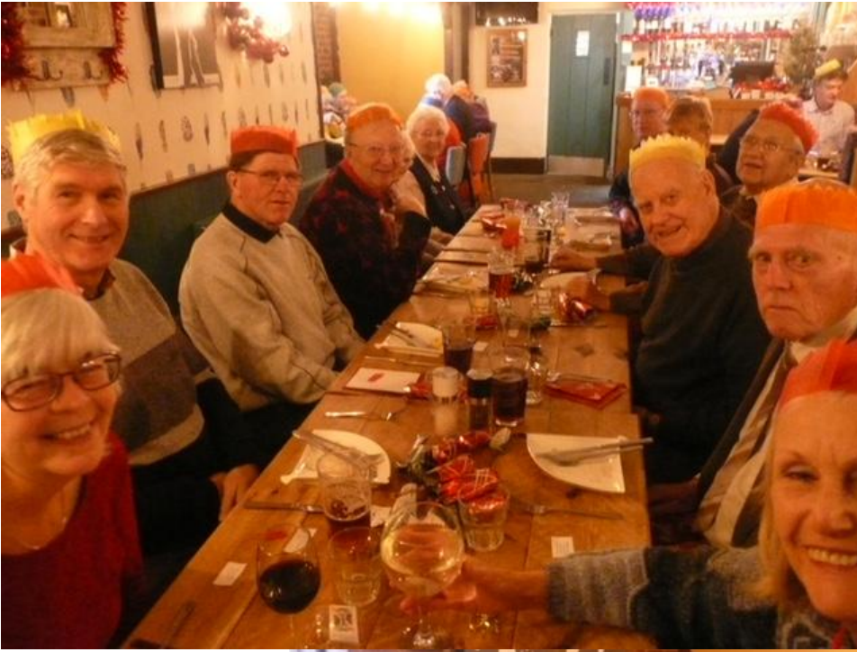
Tailenders' Christmas Lunch December 2017